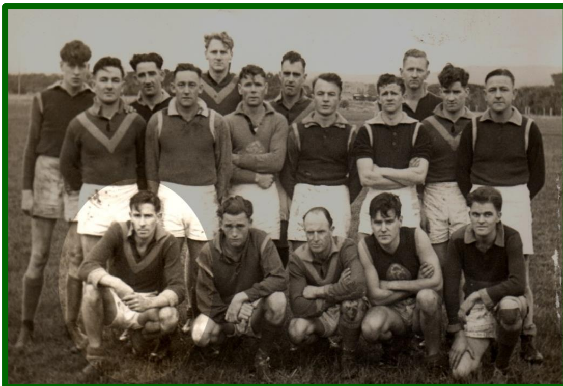
Another team photograph from 1947 ( perhaps taken at a club training session ).

Note: If readers can recognize players in these photograph please contact the club. Thank you.