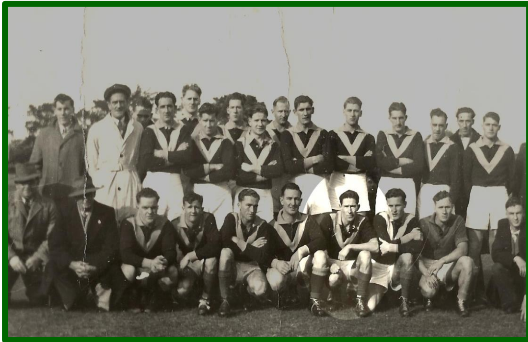
The 1947 team and club officials.

Note: If readers can recognize players in these photograph please contact the club. Thank you.