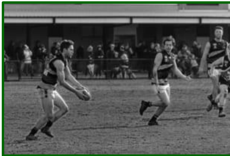
Going forward with confidence.