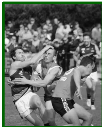
Never far from the action