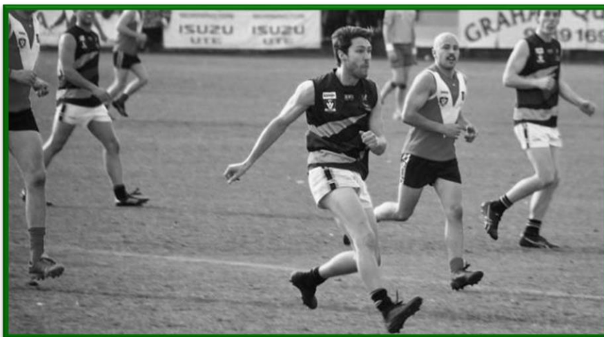
One of Dromana's finest-ever midfielders