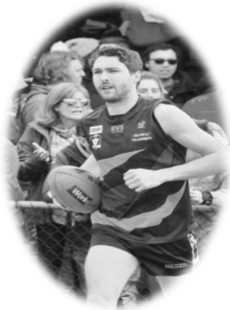
Once again at the front of his team.