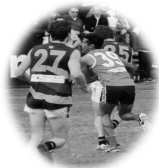
The famous number 27 for DFNC.