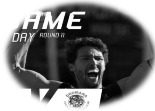
The face of Dromana in Round: 11 in 2018