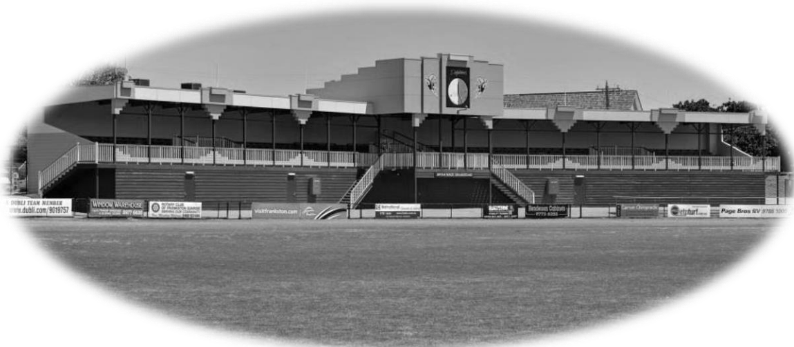
Frankston Park- The venue for the 2019 Division: 1 Grand Final.