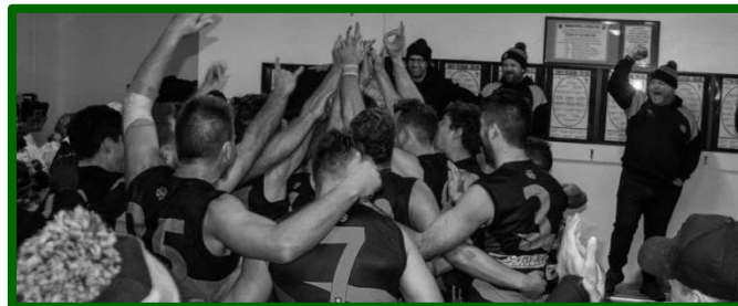
A fighting victory over Sorrento in Round: 13 -a triumph to celebrate.