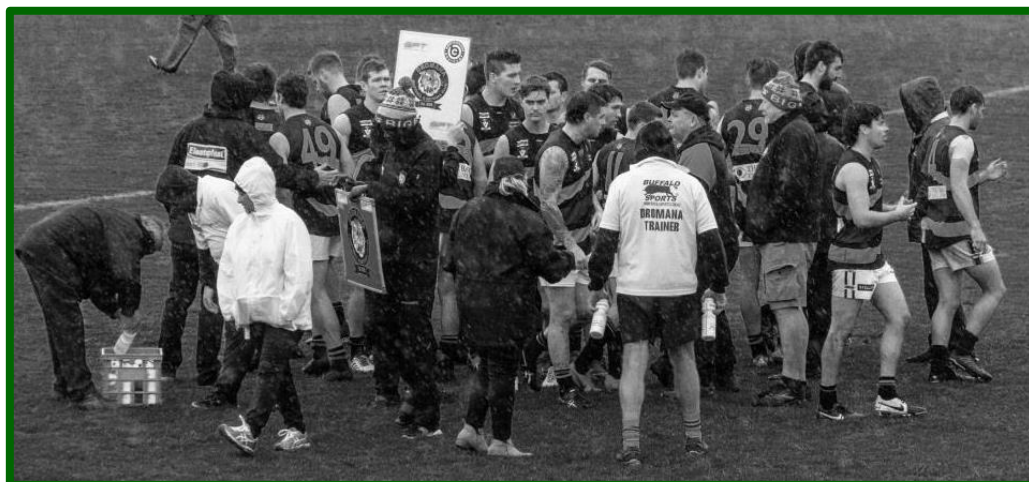
Round :11 - A fighting victory on a wet and wintry day at Baxter Park.