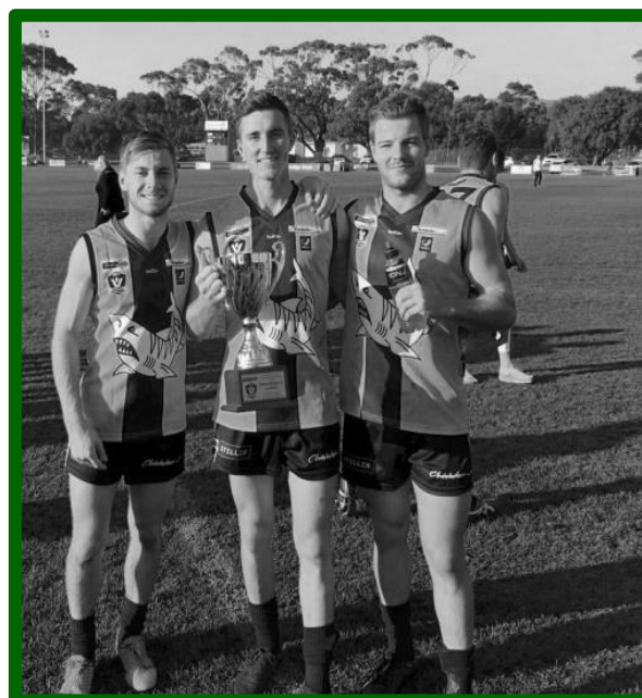
A HIGHLIGHT OF DFNC IN 2019.