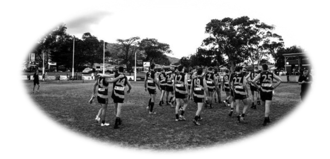
An impressive victory to enjoy together

Everyone at the game agreed that Frankston won the second half (six goals to three) but the leeway was too great overcome and the Tigers went onto win by six goals. Furthermore, the performances of the young Tigers' had signalled to the rest of the league that they were competitive, skilled and buoyant.