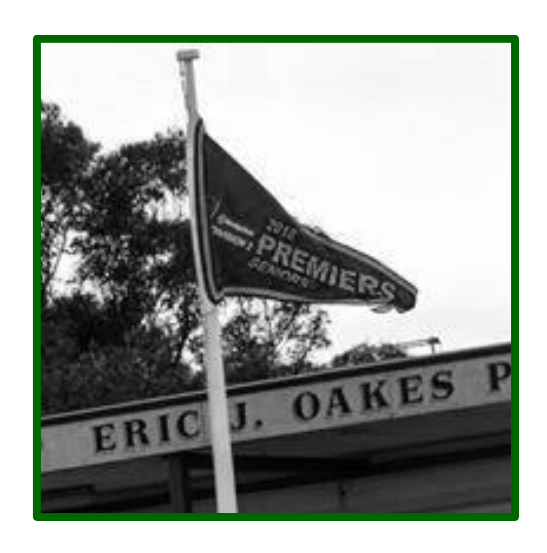
The 2018 MPNFL Division: 2 Premiership flag was unfurled.

The first quarter was a dour struggle as both teams sought 'the advantage' and pathways to goal. There were no 'beg your pardons' and it was hard-hitting football as opposing players wrestled for early supremacy. It was a typical Frankston-Dromana contest; and it was nothing that was unexpected.