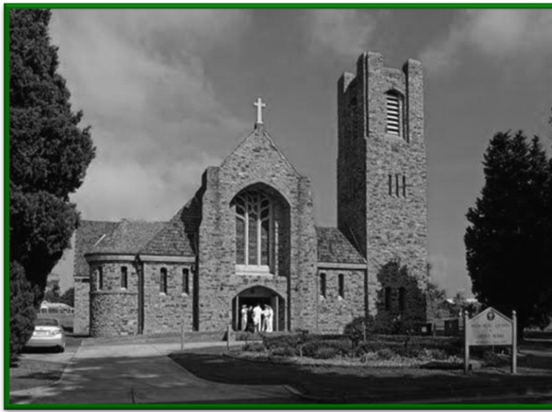
St Mark's Chapel at HMAS Cerberus