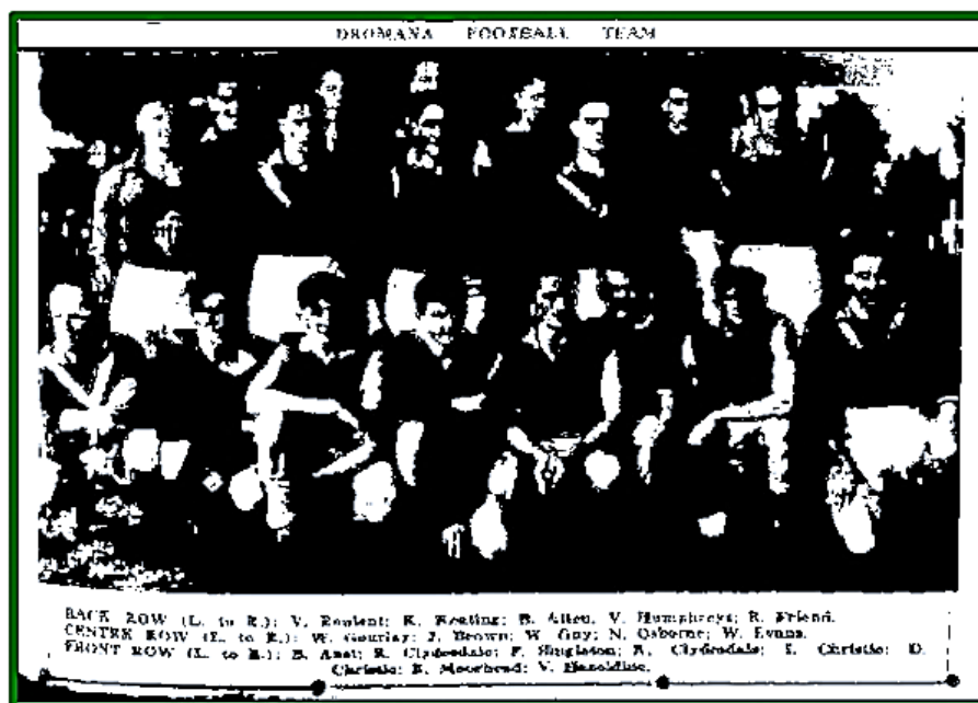
1946 Dromana team