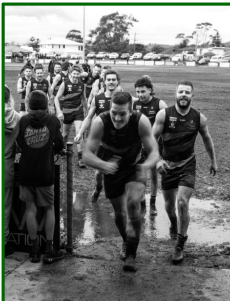
Mud larks in the wet and heavy conditions at Pier Street.