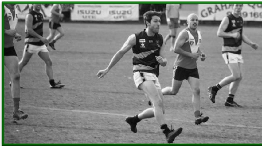
One of MPNFL's finest-ever midfielders.