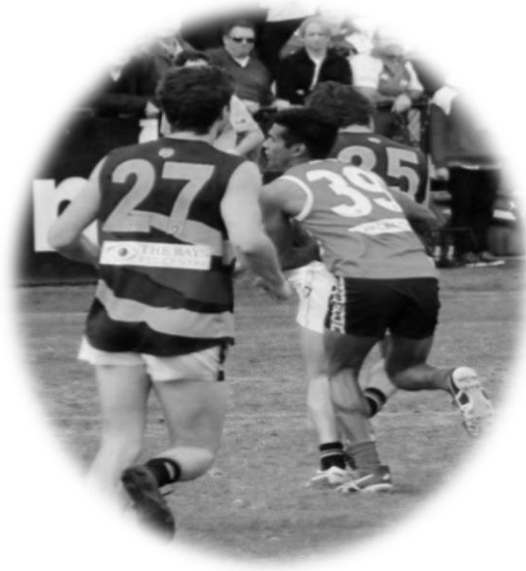
The famous number 27 in action for DFNC.