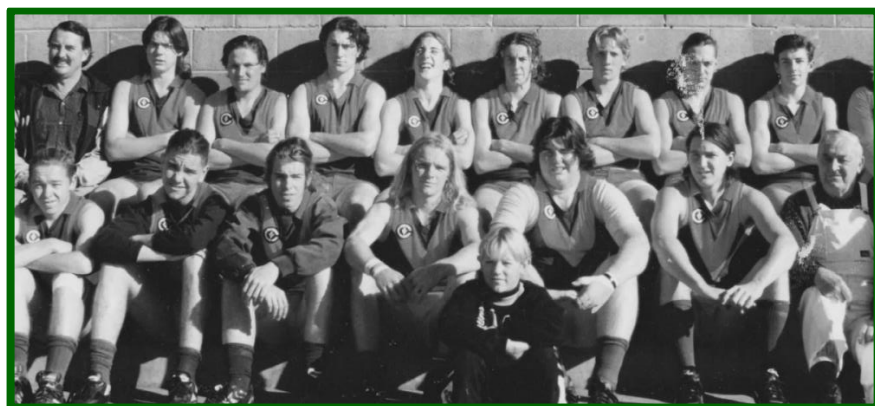
This photograph was taken in the late 1990's; and is of the DFNC Third XVIII.