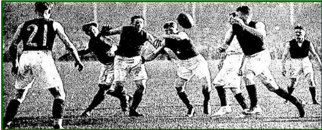
A CENTURY AGO

A photograph from the 1923 Grand Final between Essendon and Fitzroy.