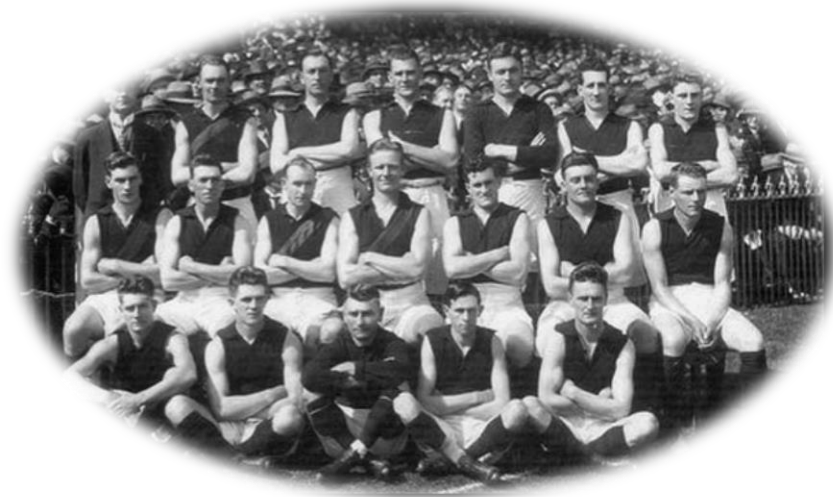
The triumphant Essendon team of 1923.