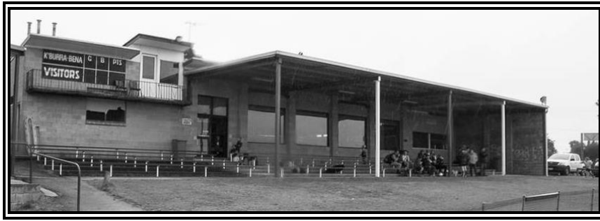
Korumburra- Bena Football Club