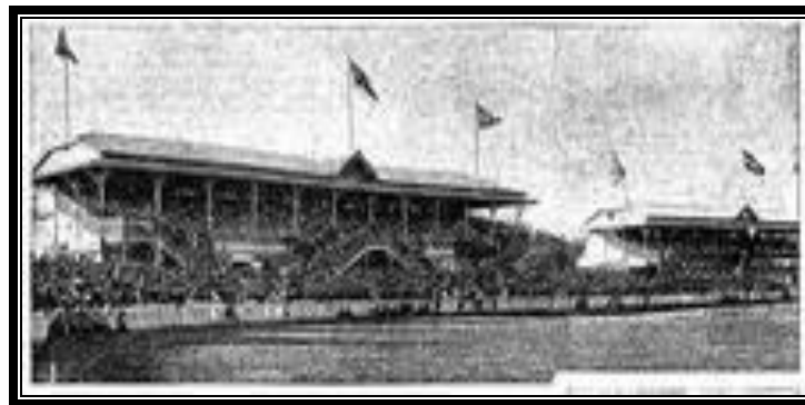
Victoria Park in earlier times.